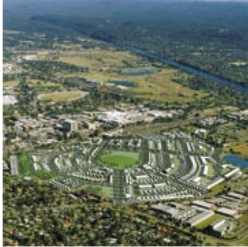
Thornton Park, Penrith NSW – 50 hectare site rezoned to become an urban village with a site specific Development Control Plan.