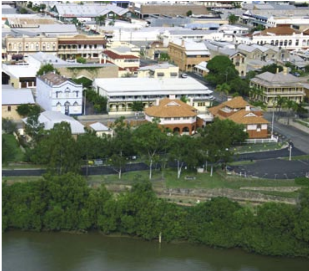
De 21st century city.