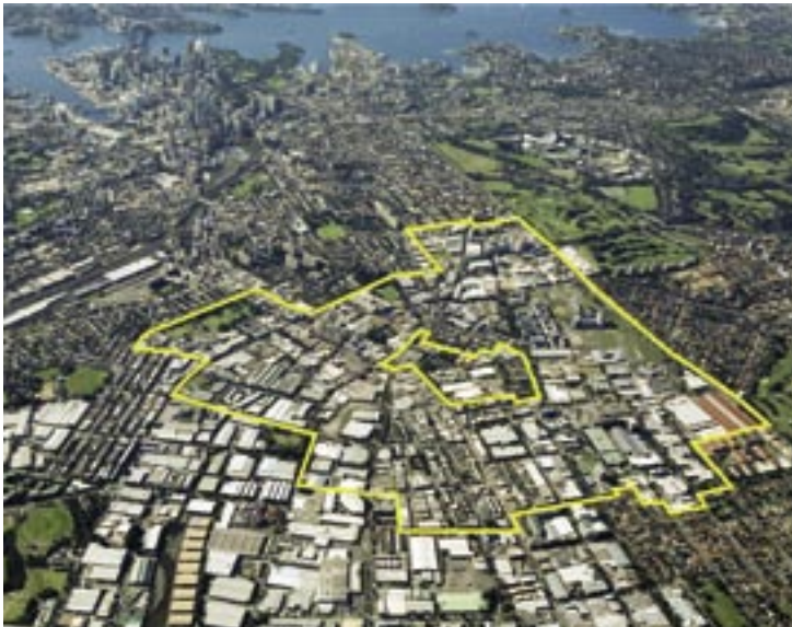
The keyline indicates the 280ha study area excluding the town centre. This area is subject to higher density re-urbanisation around the new Green Square Railway Station.