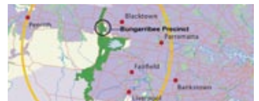
Western Sydney Parklands' 27km corridor indicated in green.