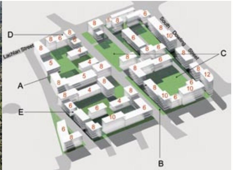
Illustration showing some recommended changes to street blocks: