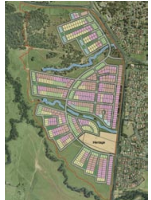
Bungaribee development with fingers of green interfacing with parkland.