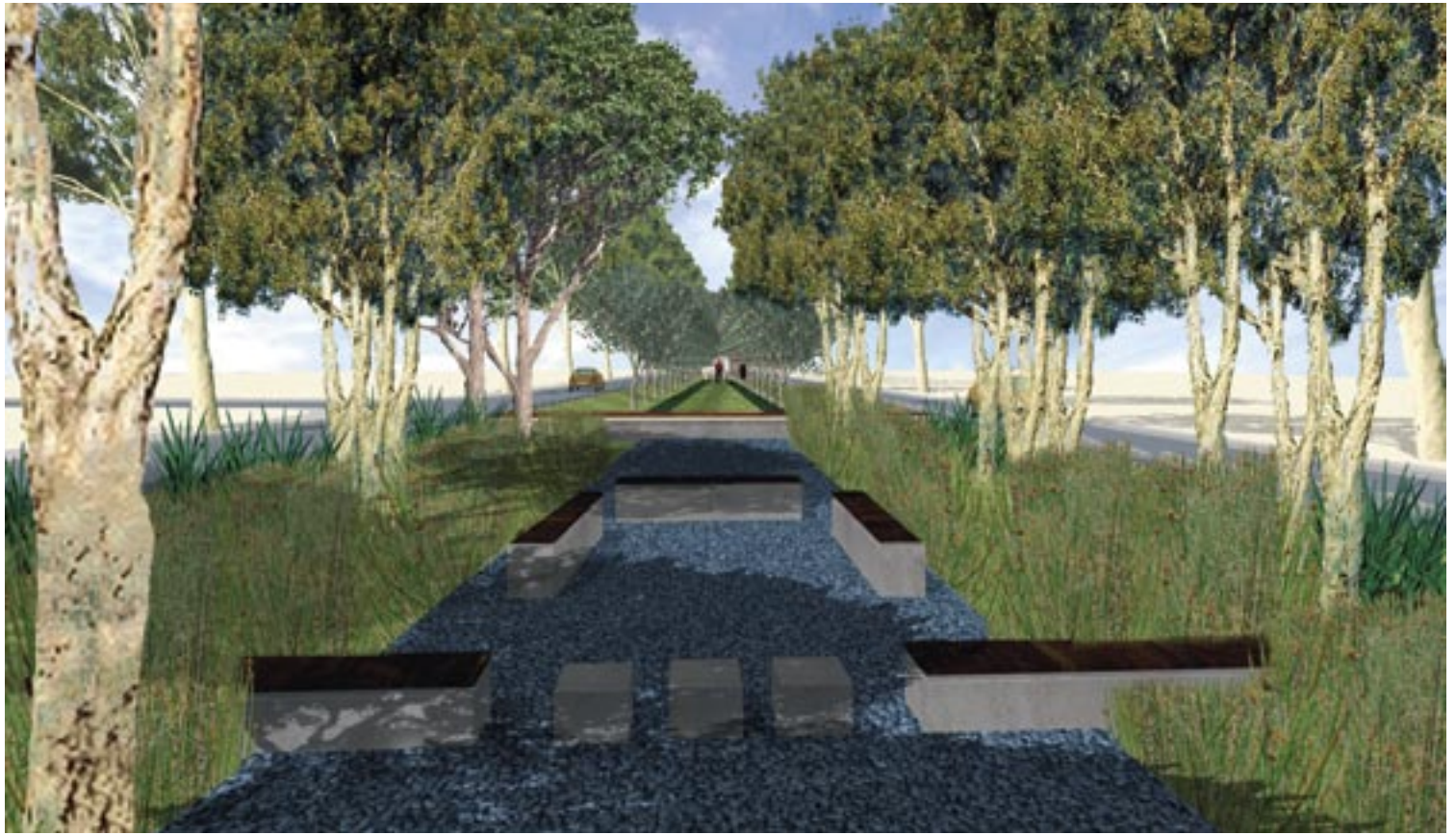
Landscaped eco medians provide open recreation space in the dry and help drain water from the site in the wet.