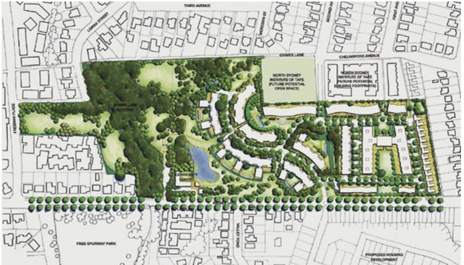
The Parklands' Concept Plan at Mobbs Lane, Epping.