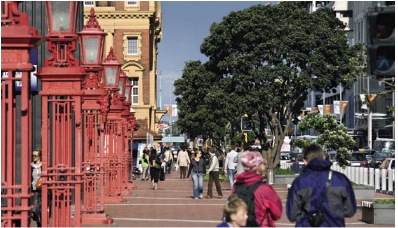
Quay St, Auckland along the harbour front upgraded to the Architectus design.