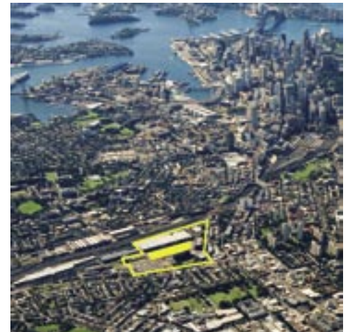
Keyline indicates Australia Technology Park. Filled area indicates Channel 7 Site.

Cover Inspiration: Architectus has had a primary role in the planning and urban design of the following projects: Central Sydney Plan, Ultimo/Pyrmont Precinct Plan, Green Square Built Form Review, Redfern/Waterloo Built Form, Walsh Bay Development Plan, Woolloomooloo Wharf Development Plan, Oxford Street Streetscape Study, Australian Technology Park Master Plan, Sydney Airport Environs Study, Sydney Airport to City Rail Link Route Options Study, Eastern Distributor EIS Urban Design Study, Botany Bay Port Expansion EIS Visual Assessment, Glebe Island/White Bay Port Master Plan, East Darling Harbour Port Master Plan, and review of The Rocks Urban Form Study