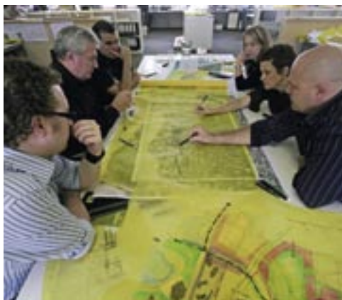
Coolangatta ideas workshop.

South-east Queensland can become an exemplar of sustainable sub-tropical design if key recommendations from a report by Architectus are implemented.