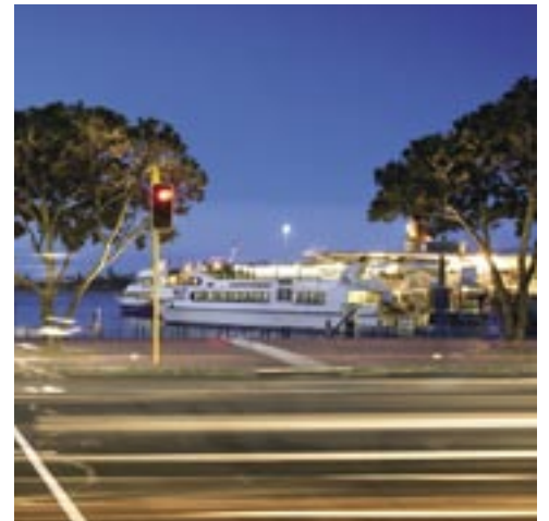
Queen St, the main street of Auckland.

Key nodal areas defined by historical and topographical significance will be marked by specially commissioned collaborative projects involving artists and other designers.