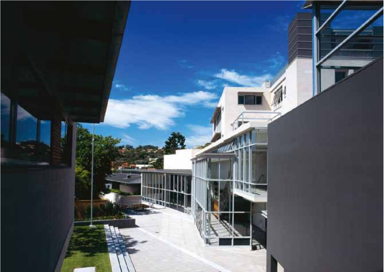
Queenwood School for Girls Redevelopment, Balmoral