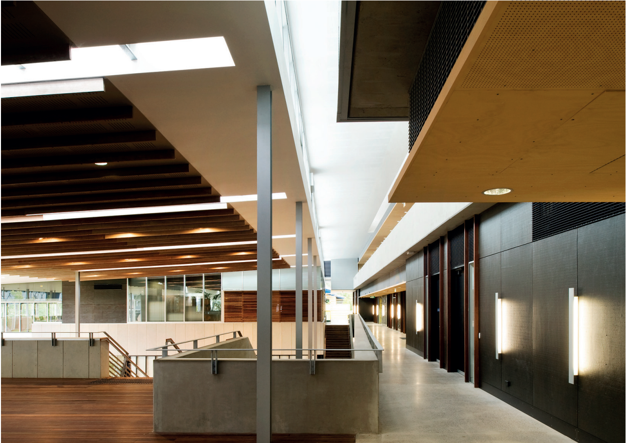
Upper level circulation areas are open to natural light and air